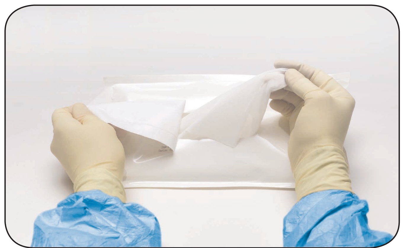
Withdraw a presaturated wiper from the package. Reseal the container to avoid evaporation.

A guide to properly fold and use a low-linting presaturated wiper for maximum efficiency and effectiveness in a controlled environment.