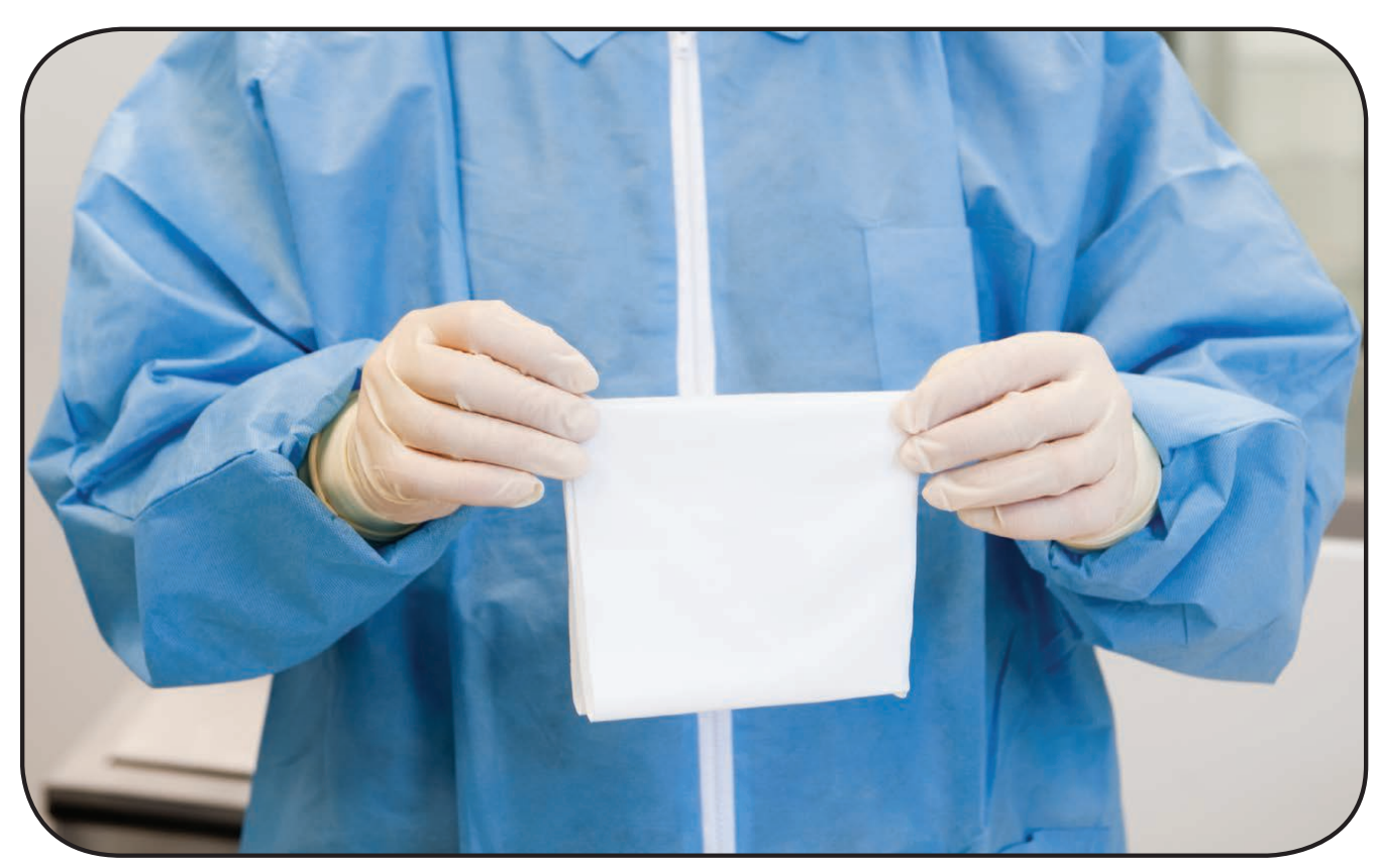
Fold the wiper in half again, creating four cleaning faces: two outside and two inside.