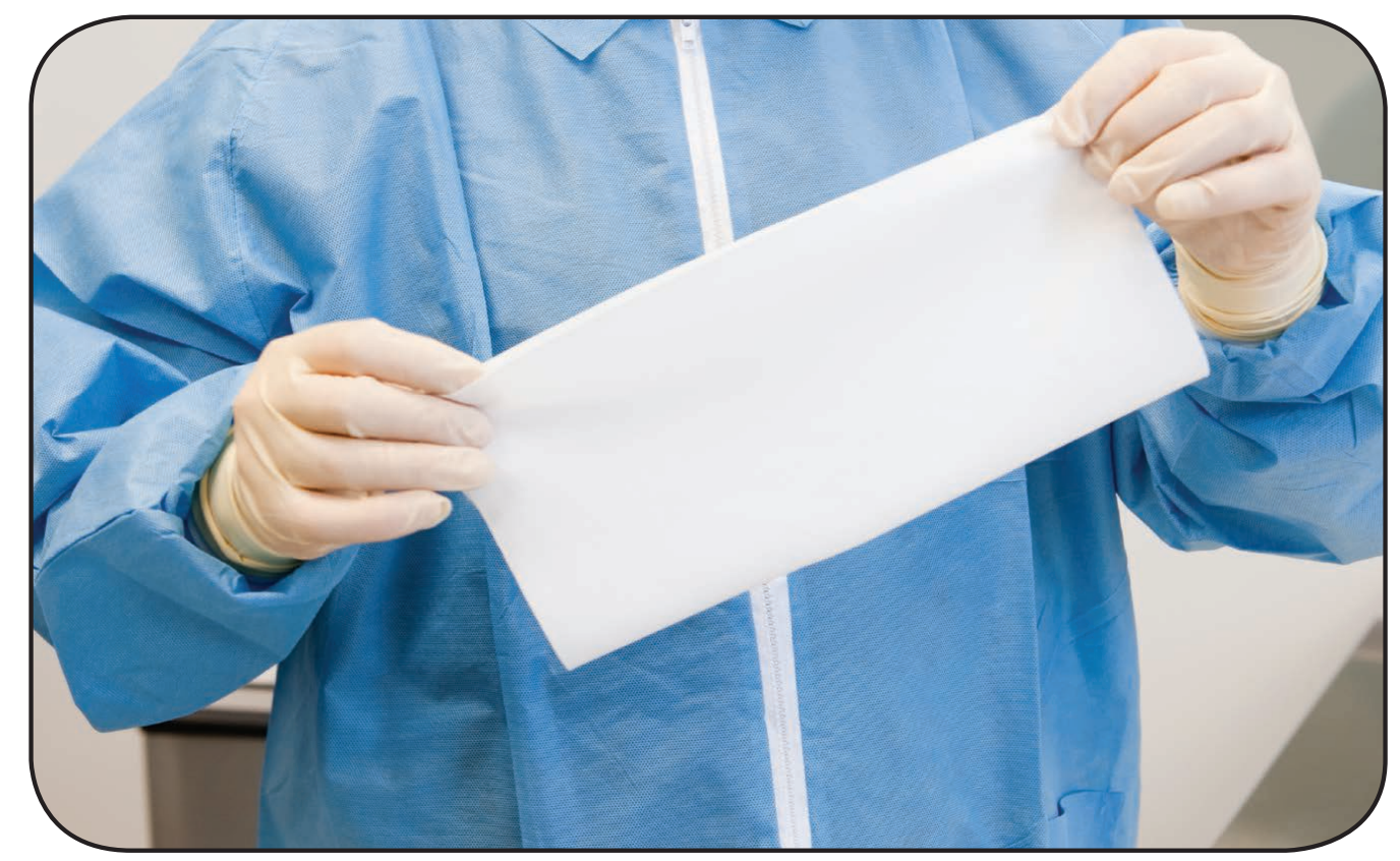
Wiper may be completely unfolded, reversed, and refolded beginning again at Step 1 to enclose the four contaminated faces and expose the four remaining clean faces.