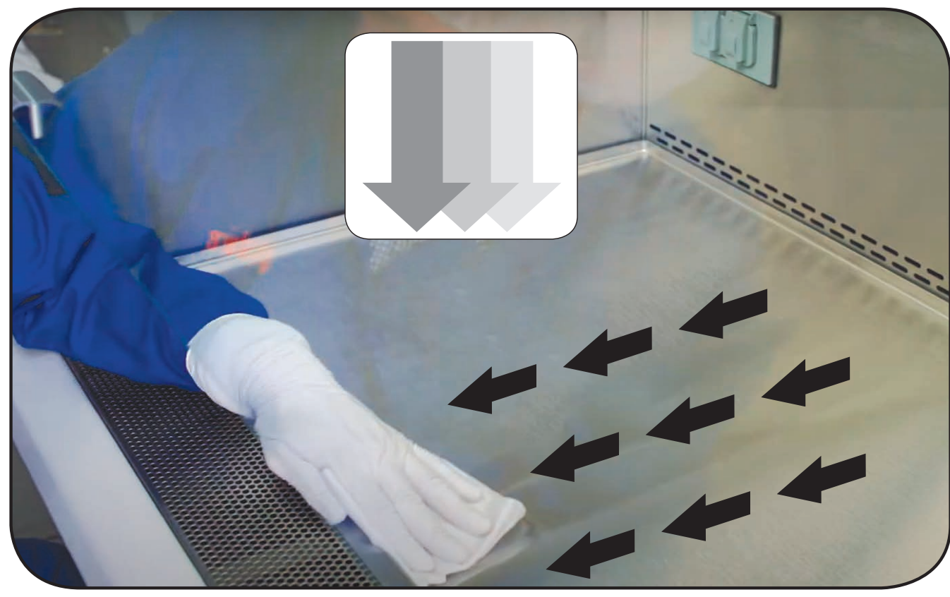
Work from the cleanest areas to the dirtiest areas in long, overlapping unidirectional strokes. Each face of the wiper will be used for one straight stroke. Turn the wiper over and make a second stroke.